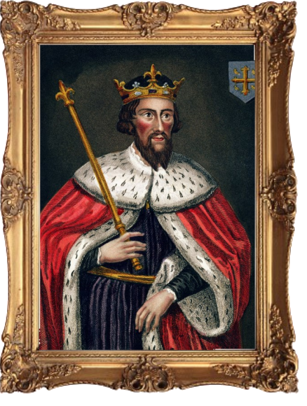
Alfred the Great

Monarchs often go to great lengths to ensure that their official portraits portray a particular message. What do the below paintings tell you about these sovereigns?