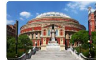
Royal Albert Hall