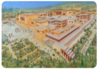
Reconstruction of the palace of Knossos

The Minoan civilisation existed between c3000 BC and c1100 BC on the Greek island of Crete. At the civilisation's peak, around 10,000 people lived in 90 cities. As Europe's first developed civilisation, the Minoans lived in towns with roads, wells and a basic sewerage system. They were capable farmers and skilled craftspeople. Their architects oversaw the building of palaces. They were also skilled in making pottery. They traded goods, such as olive oil, pottery and cloth. The Minoans also used an early writing system known as Linear A.