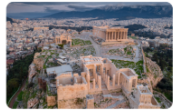
Aerial view of the Acropolis

The Classical period started in c500 BC and ended in 323 BC. It is known as the golden age of ancient Greece because many discoveries and advancements were made. People in the Classical period believed in gods and mythology from earlier periods, although philosophers and scientists at the time began to challenge those beliefs. Their architecture featured symmetrical designs and columns. Like the Minoans and Mycenaean before them, people in Classical Greece established trade links both within Greece and with surrounding countries.