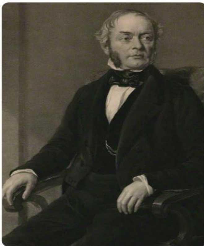
Samuel Wilderspin (1791–1866)

Samuel Wilderspin was a teacher who is known as the founder of infant education. He had enjoyed learning at home and looked forward to going to school. When he started school he didn't like the strict teachers or the boring lessons. He believed that children should enjoy school and be happy. He invented the school playground so children could play outside.