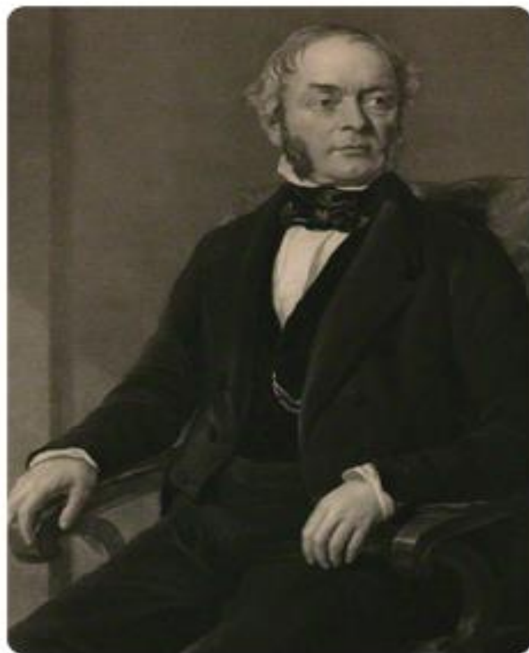
Samuel Wilderspin (1791–1866)

Samuel Wilderspin was a teacher who is known as the founder of infant education. He had enjoyed learning at home and looked forward to going to school. When he started school he didn't like the strict teachers or the boring lessons. He believed that children should enjoy school and be happy. He invented the school playground so children could play outside.