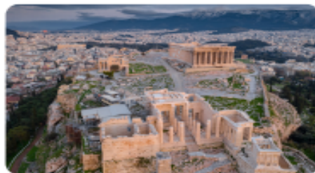
Aerial view of the Acropolis

The Classical period started in c500 BC and ended in 323 BC. It is known as the golden age of ancient Greece because many discoveries and advancements were made. People in the Classical period believed in gods and mythology from earlier periods, although philosophers and scientists at the time began to challenge those beliefs. Their architecture featured symmetrical designs and columns. Like the Minoans and Mycenaean before them, people in Classical Greece established trade links both within Greece and with surrounding countries.