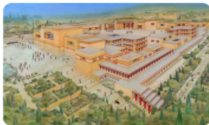
Reconstruction of the palace of Knossos

The Minoan civilisation existed between c3000 BC and c1100 BC on the Greek island of Crete. At the civilisation's peak, around 10,000 people lived in 90 cities. As Europe's first developed civilisation, the Minoans lived in towns with roads, wells and a basic sewerage system. They were capable farmers and skilled craftspeople. Their architects oversaw the building of palaces. They were also skilled in making pottery. They traded goods, such as olive oil, pottery and cloth. The Minoans also used an early writing system known as Linear A.